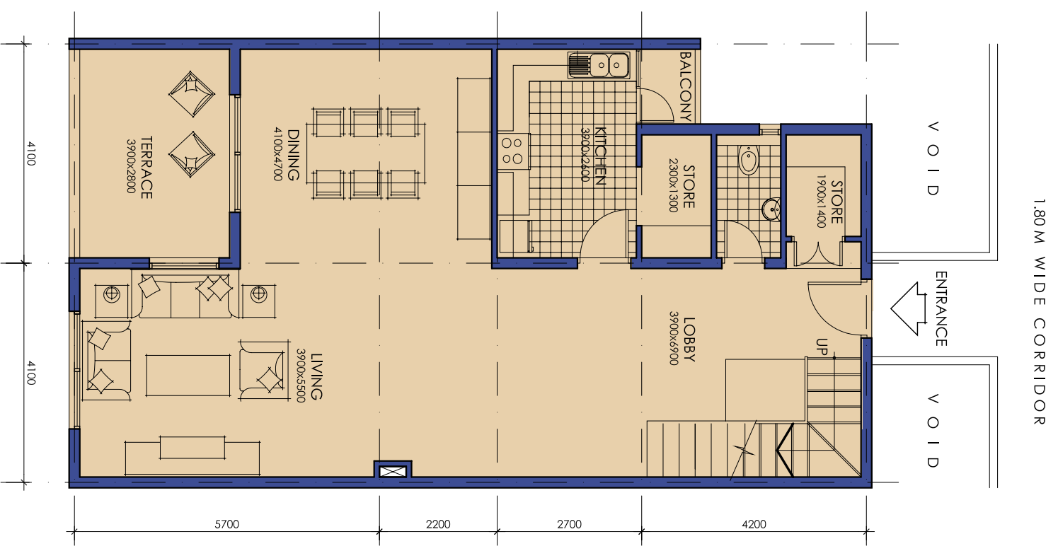
1 FIRST LEVEL SCALE 1:100 PLAN